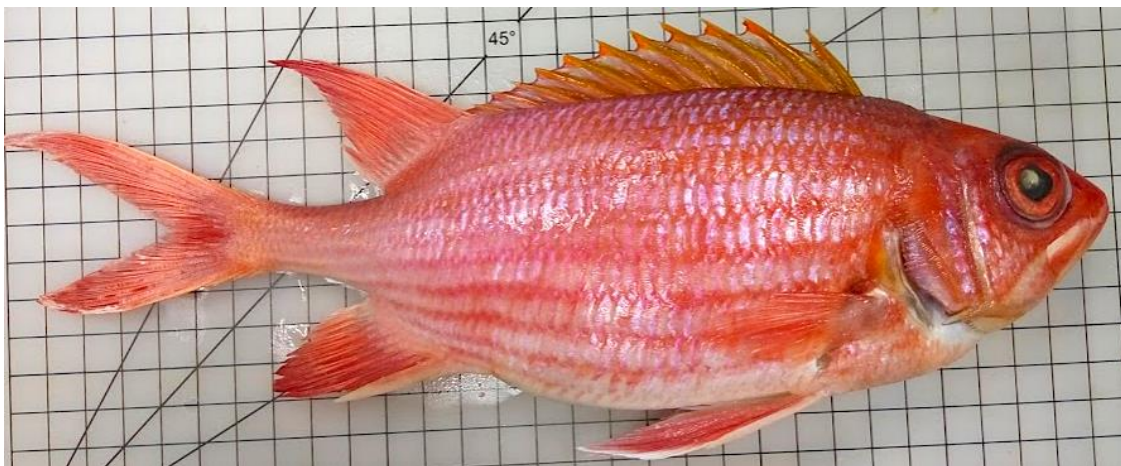
Figure 1. The Holocentrus adscensionis specimen caught from Marsascala, Malta on the 24th August, 2016. (Photo of the specimen on a 1x1cm scaled background).

The specimen caught weighs 310.82 grams and has a total body length of 301.0 mm. Its appearance, morphology and meristic counts (Table 1 and Figure 1) match the descriptions of H. adscensionis given by Carpenter, 2002; Nelson, 2006; Froese & Pauly 2016. The specimen has a moderately compressed oblong body and a long slender caudal peduncle, while the head has two very conspicuous strong spines on the sides. The anterior dorsal fin soft rays and upper caudal fin rays are elongated. The back and the upper sides of the body are reddish with some golden reflections and yellowish stripes on its back. Lighter coloured stripes get broader on the lower scale rows. The lower sides and belly are white. The snout and top of head are red, with a white streak running diagonally across the cheek. The dorsal fin spines and the interspinal membranes adjacent to the spines are yellowish-green, while the rest of the dorsal fin has a reddish pink colour. The first three anal fin spines are white while the fourth spine and the anal fin soft rays have a pink colouration (Figure 1).