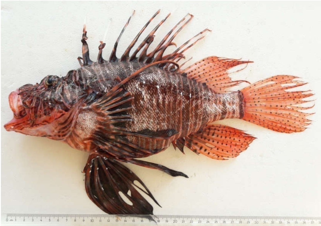
Figure 2. Picture of Pterois volitans from the Gulf of Antalya