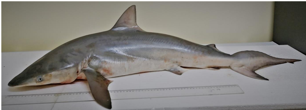
Figure 2. The juvenile specimen of the C. brevipinna