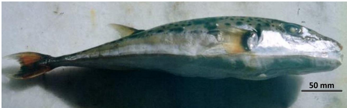
Figure 1. Lagocephalus sceleratus , recorded first in 2003 in the Mediterranean Sea

L. sceleratus is widely distributed in the tropical Indo-West Pacific Ocean as well as the Red Sea, and more recently in the eastern basin of the Mediterranean Sea (Kara et al., 2015). First confirmed record of L. sceleratus (Figure 1) in the Mediterranean Sea has been given by Akyol et al. (2005) from Gökova Bay on 17 February 2003. Previously, Mouneimne (1977) recorded it as misidentification of the similar pufferfish L. suezensis (see, Golani, 1996). This compilation work presents the update of the spreading of this invasive species throughout the Mediterranean Sea.