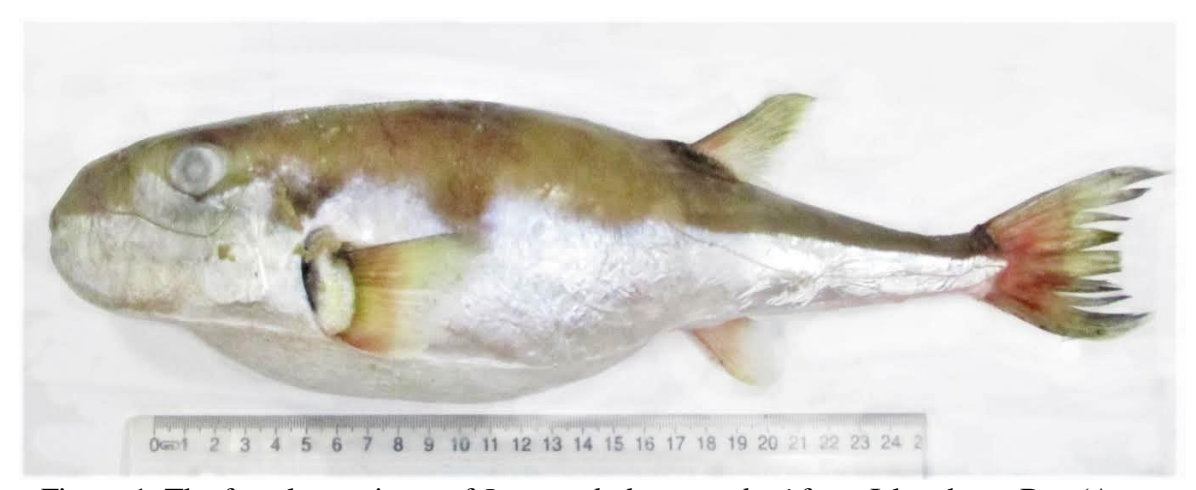
Figure 1. The female specimen of Lagocephalus guentheri from Iskenderun Bay (Arsuz coast), Turkey