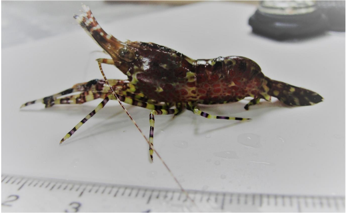
Figure 2. Saron marmoratus (Olivier, 1811) collected from Çevlik coast, eastern Mediterranean, Turkey

photographed (Fig. 2). Meristic measurements and diagnostic features were determined according to previous studies (Rothman et al., 2013; Poupin & Juncker, 2010; Baby et al. 2016).