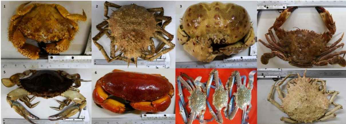
Figure 2. Some brachyuran crabs from the coastal waters of Mersin Bay. E. verrucosa 1 , M. squinado 2 , C. granulata 3 , C. longicollis 4 , C. sapidus 5 , A. roseus 6 , P. segnis 7 , M. crispata 8

In this study, eight brachyuran crab species, EE. verrucosa , M. squinado , C. granulata , C. longicollis , C. sapidus , A. roseus , P. segnis , M. crispata , were found in Mersin Bay (Figure 2).