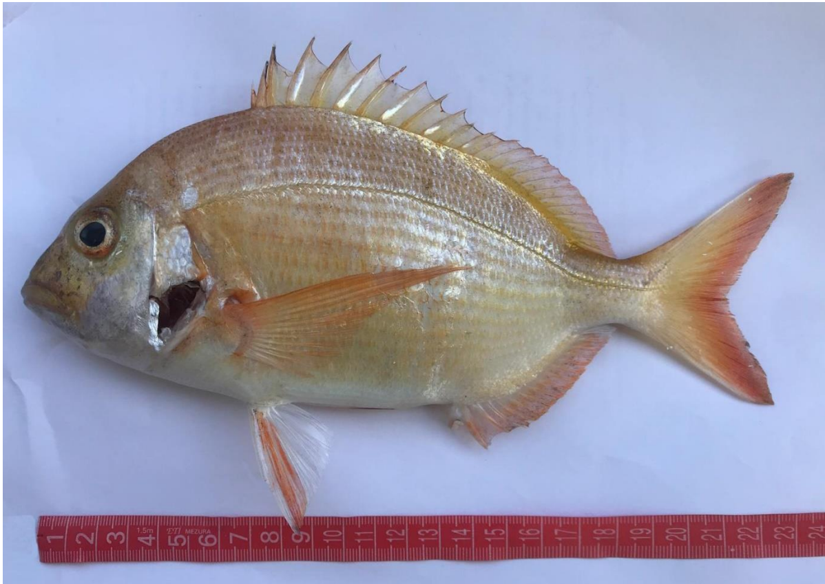
Figure 2. Diplodus sargus (Linnaeus, 1758) caught in Iskenderun Bay