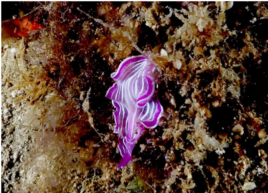
Figure 2. Prostheceraeus roseus from Cevlik coast (Eastern Mediterranean, Turkey)