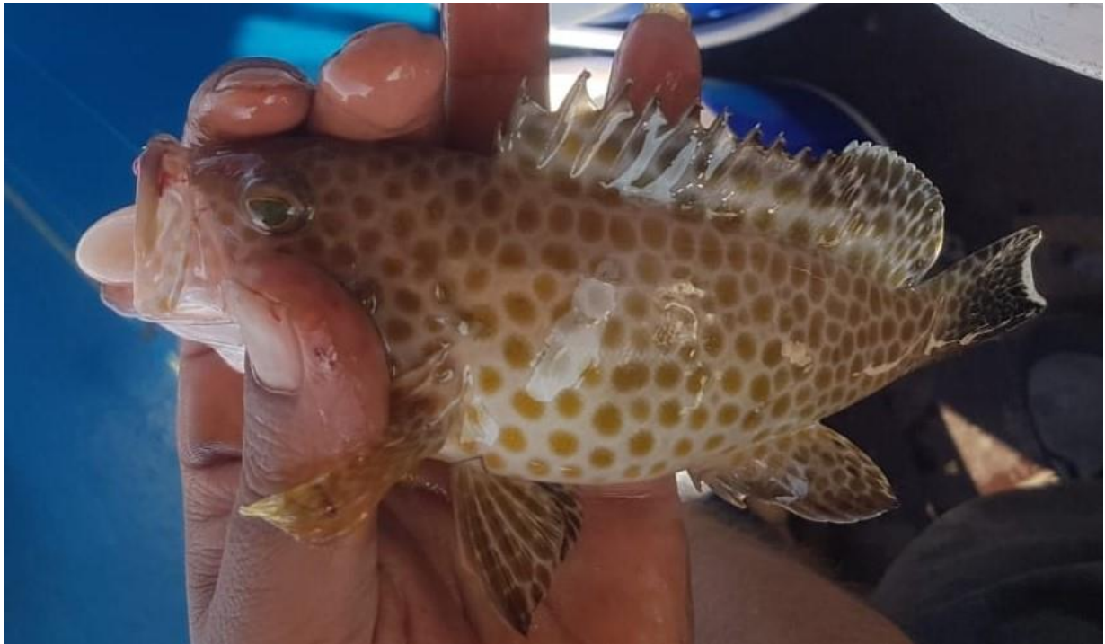
Figure 2. Orange spotted grouper Epinephelus coioides (Hamilton, 1822) captured from the Iskenderun Bay, Turkey.