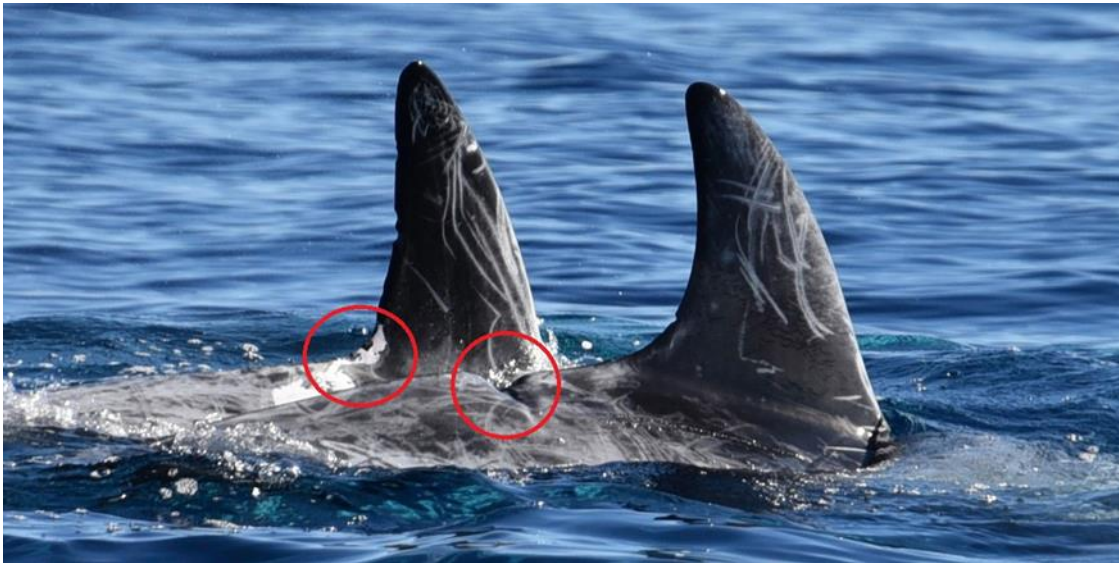
Figure 2. Two Risso's dolphin individuals with evident signs of a probable ship collision