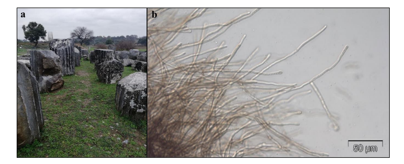
Figure 2. a) Microbial corrosion in the ruins of the ancient city of Teos, b) Hyphal extensions of Sarcinomyces sp.