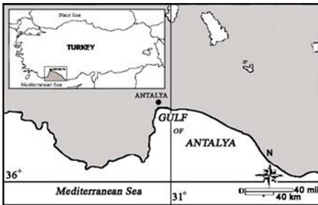
Figure 1. The map of Gulf of Antalya where Zu cristatus is obtained.

The commercial trawler named “İdris Reis” caught a fish species that they had never seen or known before while catching shrimp in deep waters (450 m) at the 36^{\circ}25'04'' N 30^{\circ}37'17'' E coordinates of Gulf of Antalya on 04.04.2022 (Figure 1). This fish was taken from fishermen and brought to the laboratory of Akdeniz University Fisheries Faculty. The species was identified and determined as Zu cristatus , which is rare in the Mediterranean.